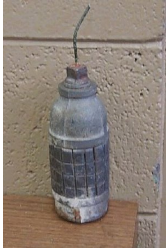
Above: LE - Pipe Bomb