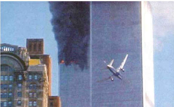
Left: LE - Aircraft used as a guided missile.