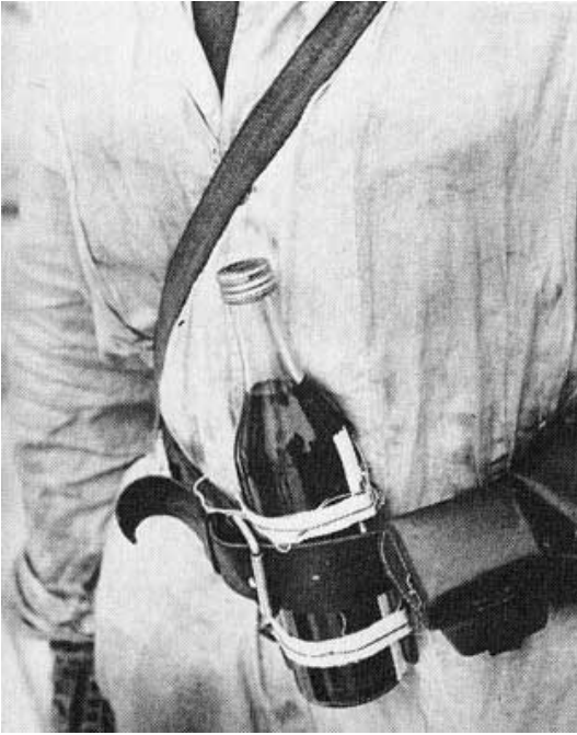
Above: LE - Molotov Cocktail.

LE create a subsonic explosion and lack HE's over-pressurization wave. Examples of LE include Pipe bombs, Gunpowder, and most Pure Petroleum- Based bombs such as Molotov Cocktails, or Aircraft improvised as guided missiles. HE and LE cause different injury patterns. Images of LE are shown below: