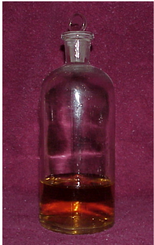
Right: HE - Nitroglycerin - liquid explosive